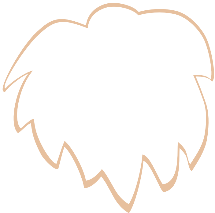
Dam and flood cookie with white royal icing

These Marbleized Spiral Fireworks look best iced in bright and contrast colors. We used white as the base layer to emulate the night sky and accented with red and royal blue.