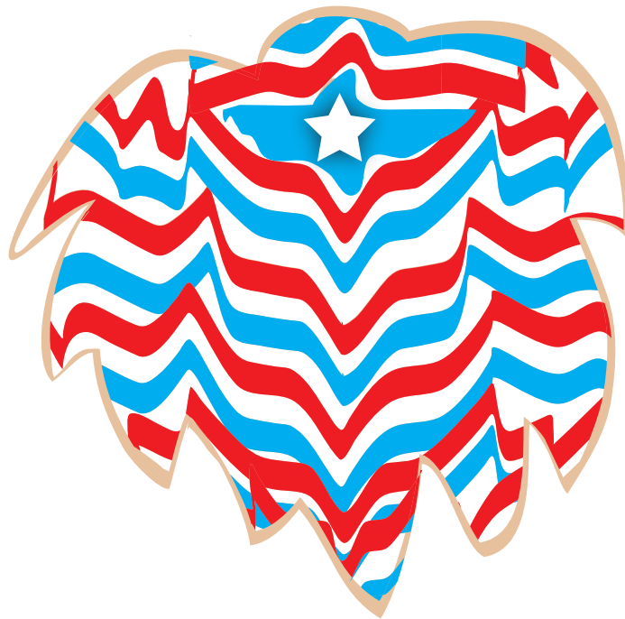
While icing is still wet add star candy at center burst dot. Let dry for 8 hours or overnight.